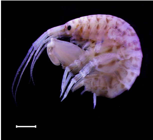
Fig. 1. Abludomelita rotundactyla (Ren, 2012), male, 8.7 mm, Scale bar = 1.0 mm.

Megamoera aequidentatum Labay, 2013: 94, figs. 23–26.