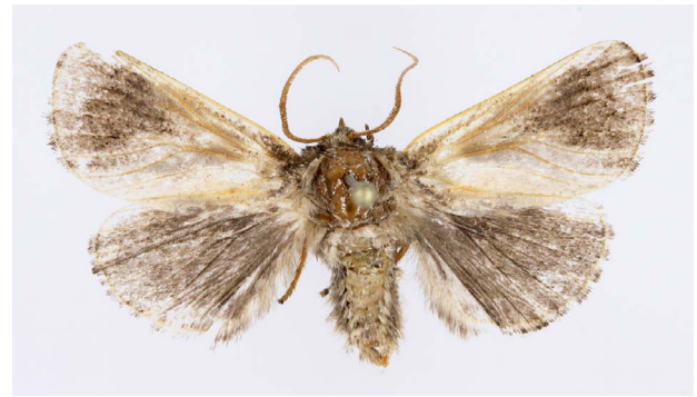
Fig. 1. Adult of Hampsonella takemurai (Inoue) from Korea. Wingspan 28 mm.

Material examined. Korea: 3 males, JN: Shinan, Heuksan-myeon, Heuksan-do, 34°41'03.2"N, 125°26'34.6"E, 15 Oct 2022, Sei-Woong Choi leg.; 1 male, Shinan, Heuksan-myeon, Hongdo, 34°40'46"N, 125°11'09"E, 13 Oct 2022, Sei-Woong Choi leg.